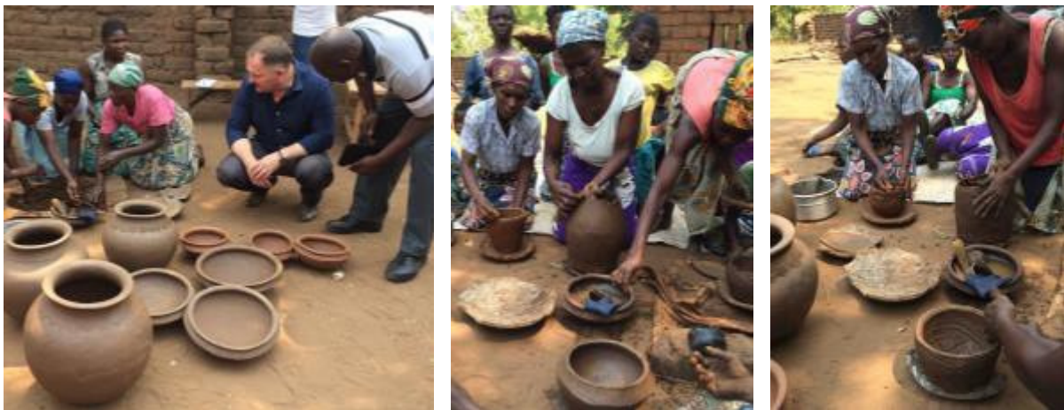
Figures 1-3. Local ceramic pot production, Chikwawa, Malawi

Ceramic filtration is most appropriate in areas with capacity for quality ceramic filter production, a distributed network for replacement of broken parts, and user training on how to correctly maintain and use the filter [5]. Malawi fits this profile well, with local pot production shown in Figures 1, 2 & 3 and an established commercial ceramic industry in Dedza. Many of the original contaminants are confined to the upper reservoir after treatment, so regular maintenance of the CWF is required. This involves scrubbing the ceramic barrier with bleach to remove any biofilm that has become established. A major disadvantage of this requirement is that the brittle ceramic may become damaged and require replacement. Despite the limitations in efficacy and long term viability, CWF technology is widely accepted by communities in many developing countries. Part of the appeal of CWF is associated with a “technology bias” where the CWF has the appearance of a modern technology and there is social prestige associated with owning one and being able to provide treated water for family and guests.