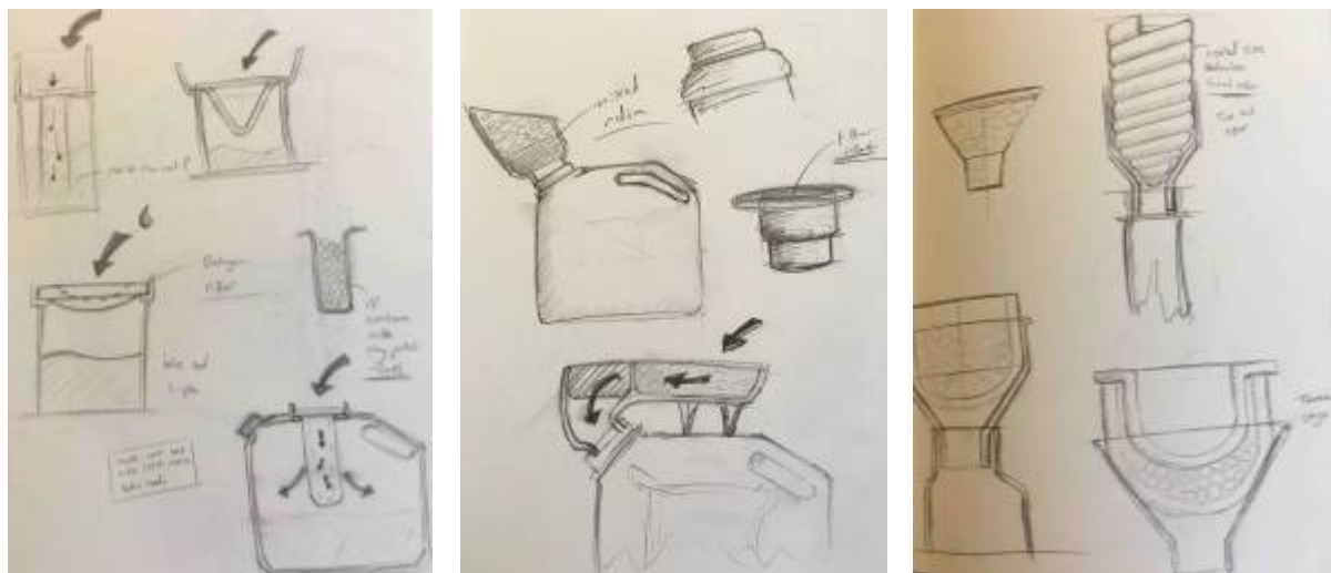
Figures 8-10. Designs for combined SODIS and CWF systems from SDW sessions

A combined design that requires users to perform SODIS before doing CWF risks users choosing only one of these steps. It will be important, therefore, to monitor perceived importance of each element in the combined system during the SDWs. Depending upon user preferences or beliefs, the system may need to be designed such that performing CWF is not possible without also performing SODIS. A SDW session was held to discuss placement options of the CWF directly on to a SODIS jerry can. The sessions were facilitated and designs visualised and documented by product design students at Bucks.