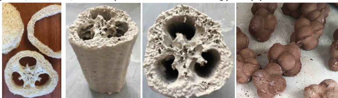
Figures 11 - 14. Examples of analogous design thinking from SDW – luffa clay filter & seed forms

Various design tools were explored through the SDW and design sessions including analogous design thinking [7] and the SCAMPER technique (Substitute, Combine, Adapt, Magnify, Put to Other Uses, Eliminate, Rearrange) [8] which helped to encourage, engage and empower all of the participants in the design process. An example of this is shown in Figures 11-13 where a luffa and other naturally occurring forms were used as donors for making ceramic filter elements. Other natural forms such as peanuts, seeds, tubes, cones and spheres have been overwhelmingly most popular in these sessions.