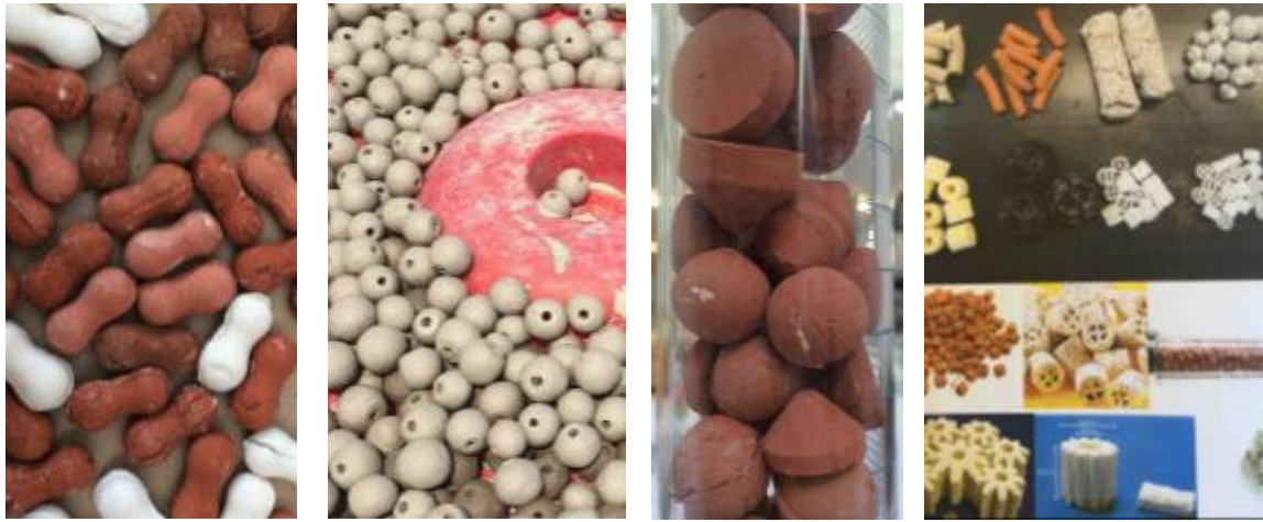
Figures 4-7 Ceramic filter modular units & geometries ideas for geometry

A combined design that requires users to perform SODIS before doing CWF risks users choosing only one of these steps. It will be important, therefore, to monitor perceived importance of each element in the combined system during the SDWs. Depending upon user preferences or beliefs, the system may need to be designed such that performing CWF is not possible without also performing SODIS. A SDW session was held to discuss placement options of the CWF directly on to a SODIS jerry can. The sessions were facilitated and designs visualised and documented by product design students at Bucks.